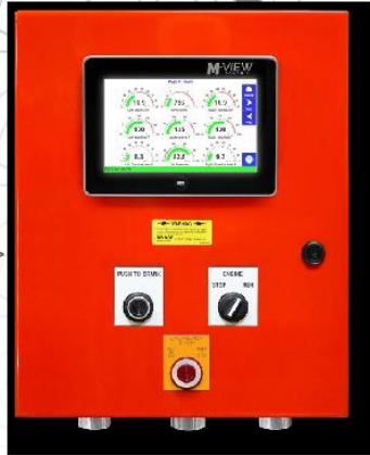
HMI PANEL >