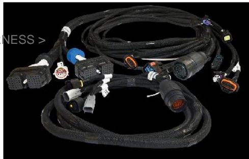
ENGINE HARNESS >